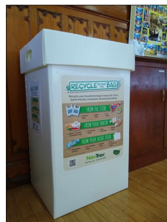
Recycle plastic bags and wraps in the “Beyond the Bags” recycling bins.